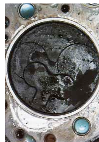
Valve Seating in a cab not using the Pill