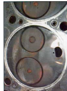
Valve Seating in a cab that is using the Pill. The difference is astonishing.